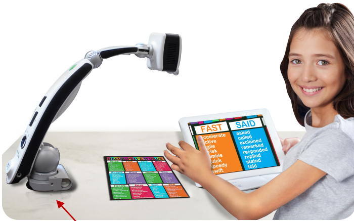
Suction base option (sold separately)

Transformer HD is available with optional Full page OCR - Reads your favorite article or book aloud. You can read a full page or select an area of text to be read. Male and female premium voices available in many different languages.